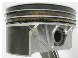
Damage from severe LSPI conditions