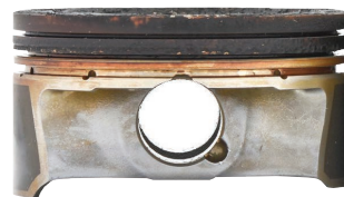
A piston protected by Cenex gasoline engine oils with over 110,000 miles

For LSPI protection, the images below show: